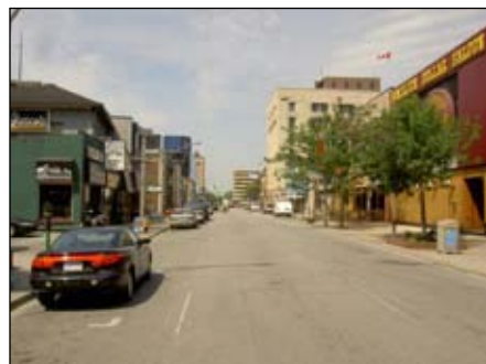
⑥ Chatham St. facing west at Bus Station