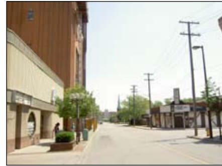
② Park St. E. at Freedom Way facing East