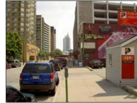
④ Pitt St. E. facing East