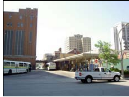
③ Bus Station facing south from Chatham St.