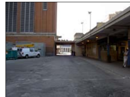
⑨ Facing South at Bus Station