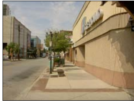
① Park St. E. at Freedom Way facing West