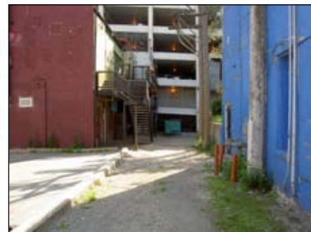
⑦ Alley behind Fidels facing East