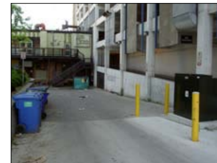
⑩ Alley west of parking garage facing North