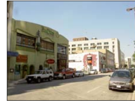
⑤ Pitt St. E. facing West