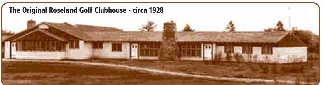
The Original Roseland Golf Clubhouse - circa 1928