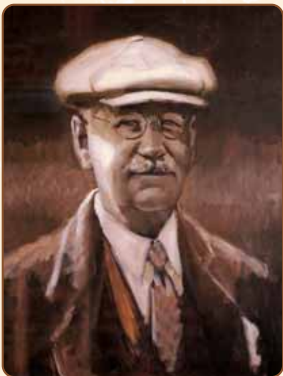
DONALD JAMES ROSS 1872-1948 Golf Course Architect