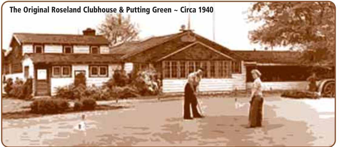
The Original Roseland Clubhouse & Putting Green ~ Circa 1940