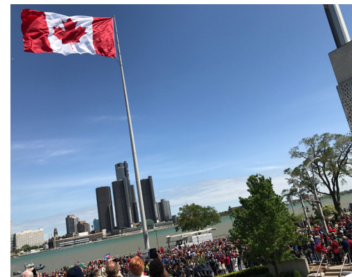
Flag Raising Ceremony - 05/20/2017