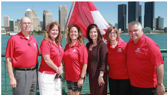
Great Canadian Flag Project - The Team