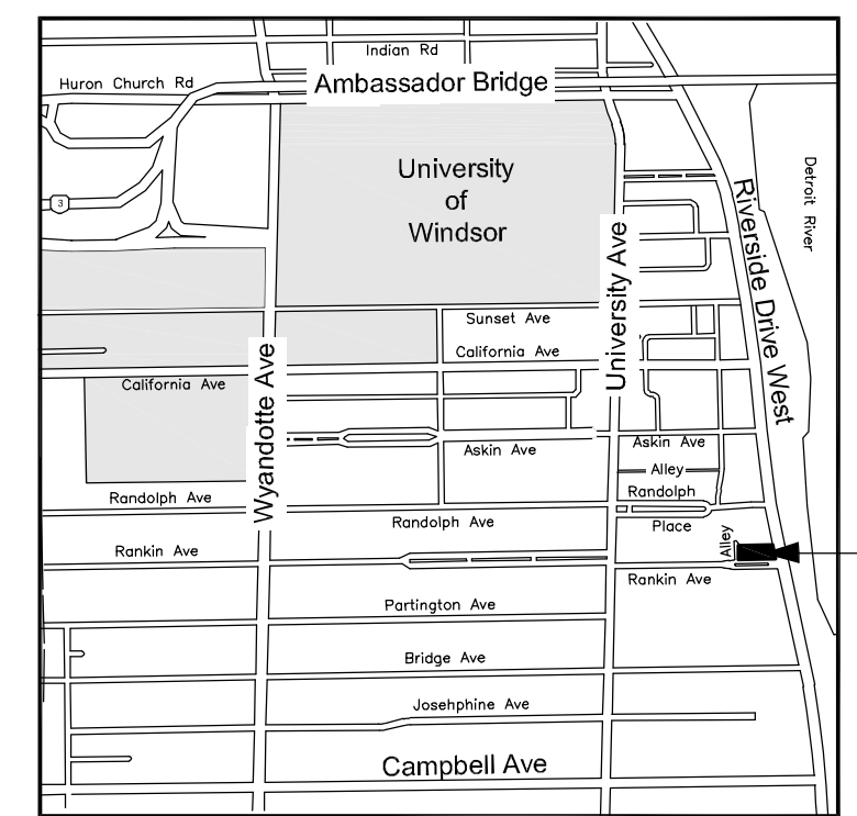
Location Map SCALE: Not to scale

LEGAL DESCRIPTION: PART OF LOT 1, REGISTERED PLAN 1163, IN THE CITY OF WINDSOR, COUNTY OF ESSEX, ONTARIO