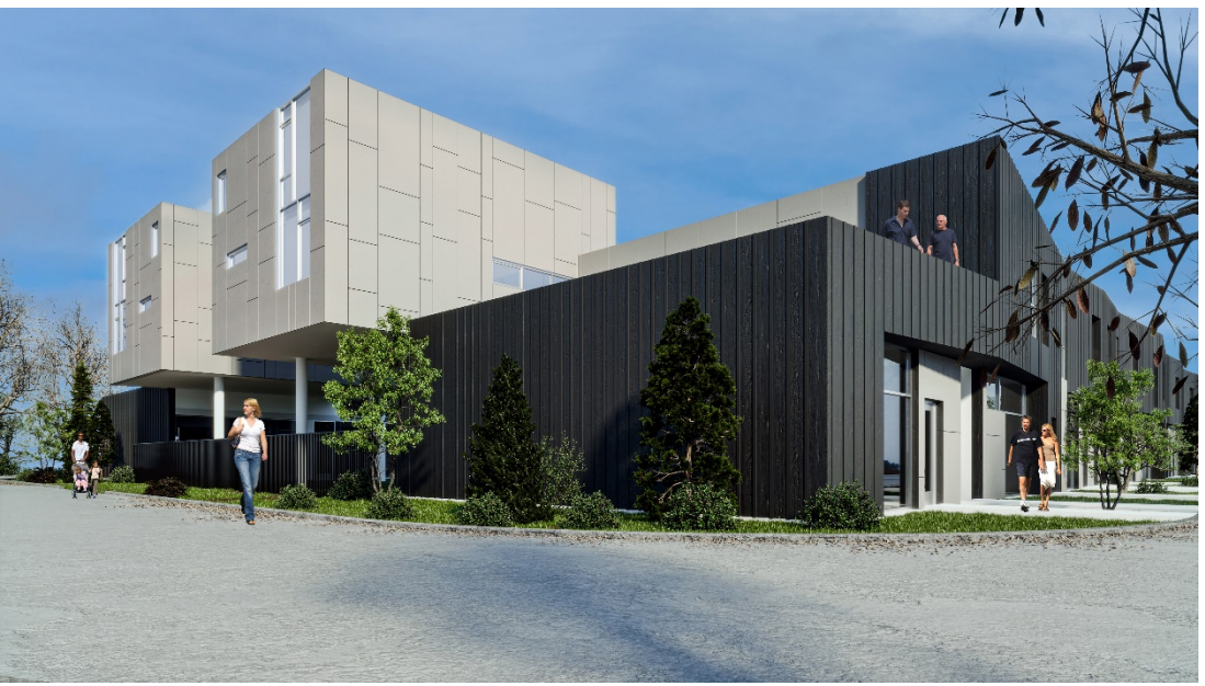
Front corner illustrating second floor terraces at corners and elevated 2-storey units with an open space for a full view of the forest strip at the entrance.

The delineation of the architectural massing and urban sectional profile are conducive to human scale. This is evident with the clear articulation of entrances separated by open/close relationships of windows and the slightly emphasised vertical height of the first story above grade. The second level develops an undulating horizontal projection in opposition to the linear first story to bring the building mass down to human scale. Other elements that are sympathetic to human scale are the building masses that overhang at each end of the open courtyard encouraging interactivity and communal interaction.