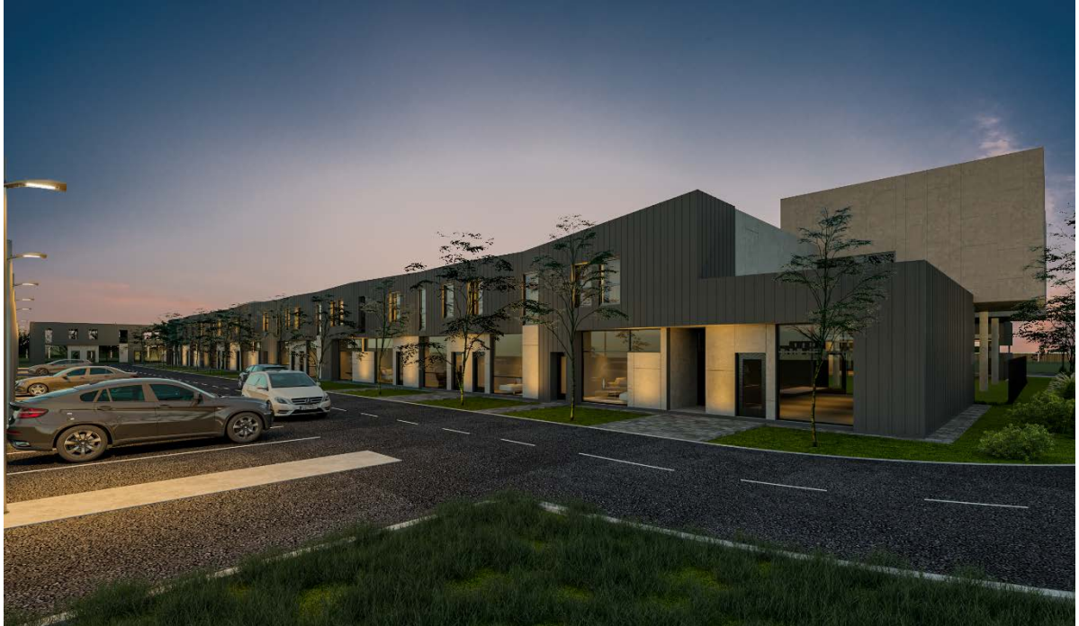
View of the public façade with rhythmic articulated entrances with individual front lawns.

The architectural development proposes a pedestrian scaled articulated public façade emphasising the horizontal character of the buildings with pronounced and rhythmically spaced entrances at ground level, large fenestration openings and an undulating second floor expression to emphasise movement and the linear perspective of the massing. At each end, the 2-storey masses are elevated off the ground to allow a covered entry to the private courtyard on either end which can accommodate various functions off the open courtyard space. At the main façade facing, Grove Avenue, the enclosed building forms are deliberately broken offering a view corridor of the courtyard forest.