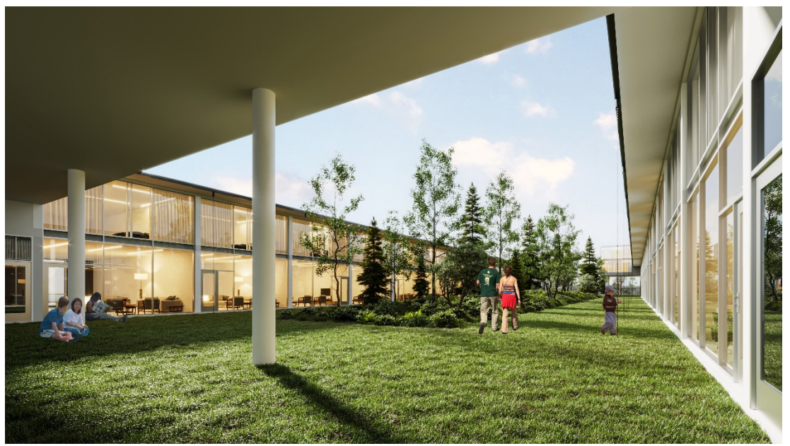
View looking into the private courtyard which brings natural light into all units and creates an internal naturalized amenity space which adds privacy and interpersonal interactions.

The proposed exterior amenity area (private courtyard) intends to develop a slice of a naturalized forest region to benefit the residents and act as a visual anchor for the entrance of the development. This also addresses the objectives of 8.5.1 regarding establishing an urban forest in Windsor and energy sustainable practices by increases plantings and landscaping, reducing the urban heat island affect, and incorporating daylighting strategies. The remainder of the development utilizes green zones to break up the exterior zone between parking areas and the building façade.