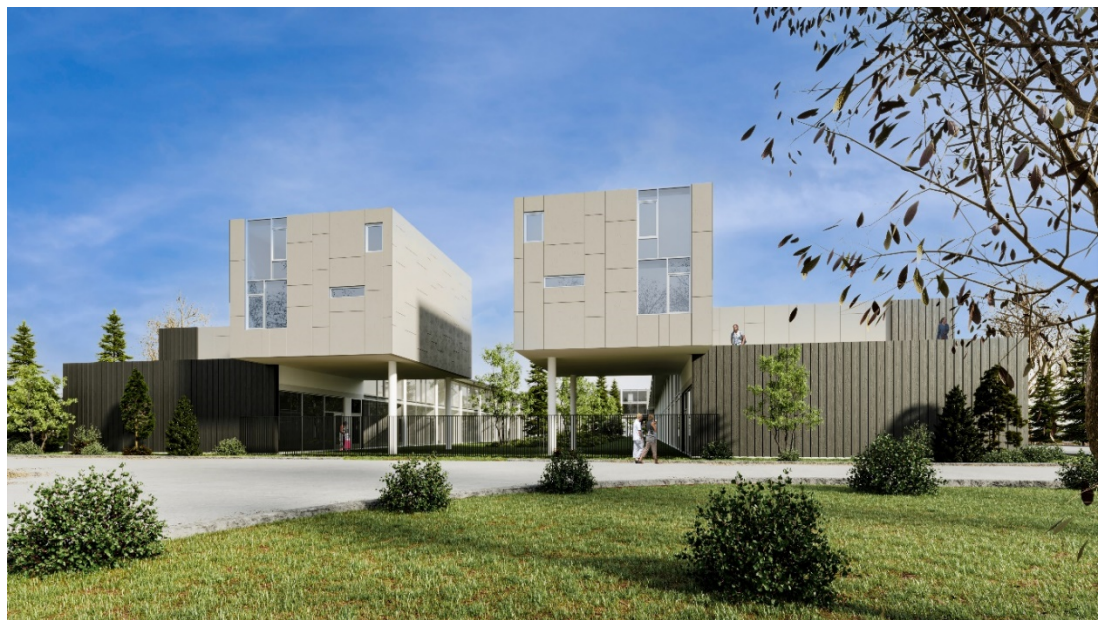
View at the front Grove Ave. façade showing the entrance drive and the public view of the private corridor

be reminiscent of the former use of the site and the relationship with the community. This sense of placemaking is deliberate and ideal. In this way, the architectural development is meant to be both novel, looking to the future, while being sympathetic to the memory of the site and the many people in the community that have indelible memories of their time in the former school during their formative years.