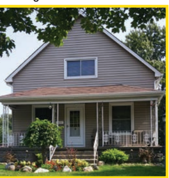
Well maintained property is a signal of "Defensible Space" - a deterrent to crime.

CPTED is not exclusive to planners, police, engineers, architects, or local officials but can also be applied by the general public. In this regard, it can be exercised by homeowners, small businesses, and those who have control over the use of buildings and spaces.