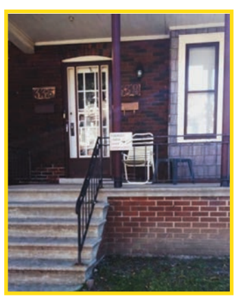
Front porches allow residents to maintain ongoing observation of their neighbourhood.

Here are some ways to maximize natural surveillance in your neighbourhood: