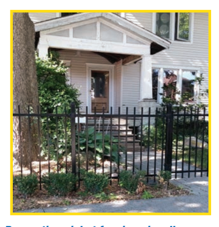
Decorative picket fencing visually separates private space from public domain.

Measures such as different textured pavement treatments, markings, or signs help to inform others by way of border definition.