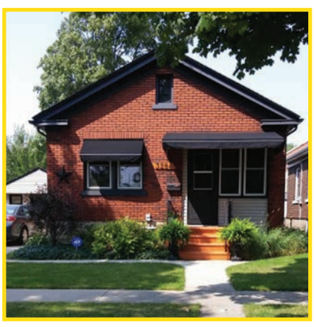
Well groomed landscaping elements indicate care and control of the property.

In order to exercise proper CPTED for landscaping, always remember to: