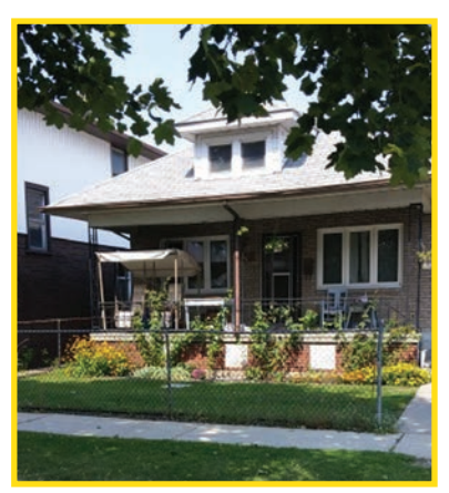
A "Celebrated" building entrance directs where access should occur.

Access control can be as simple as a neighbour on a front porch or a public reception counter that creates a "checking in" effect for visitors. Other strategies include closing streets to through traffic or having special neighbourhood parking permits.