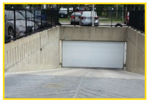
Secure, well identified vehicle access to underground parking clearly reveals access is limited to authorized users only.

Exercising access control in and around your home, business and neighbourhood is relatively easy and usually involves only modest cost. Here are some options to consider: