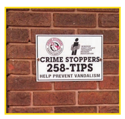
Partnering with Crime Stoppers encourages a spirit of "watching out for each other".