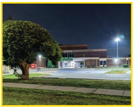
Proper lighting guides the user to the desired and safe access point of a property.

Criminals typically do not want to be seen and therefore are discouraged from conducting abnormal activity when they feel they are being watched. The strategic application of lighting can make normal users feel safe and secure, while abnormal users feel a sense of known surveillance. Affixing lights away from public reach with vandal-proof covers pro-motes legitimate use of an area. Minimum illumination