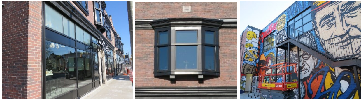
Restoration work conducted and the finished building