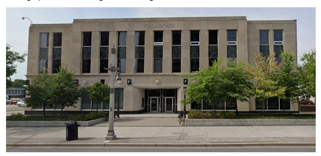
Google StreetView of the building post-restoration