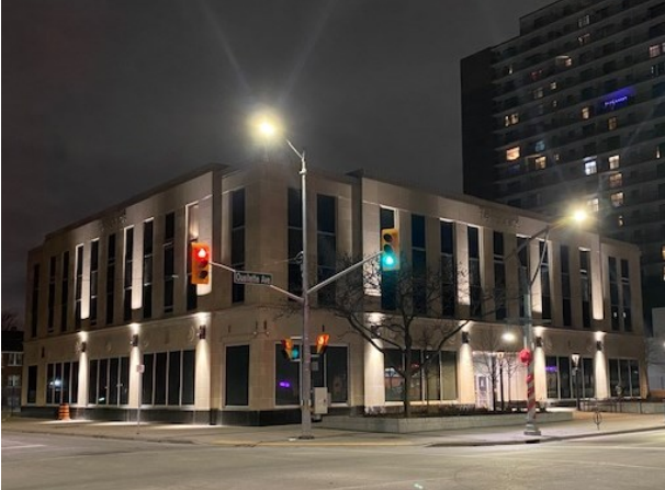
Photographs of the building after cleaning and restoration