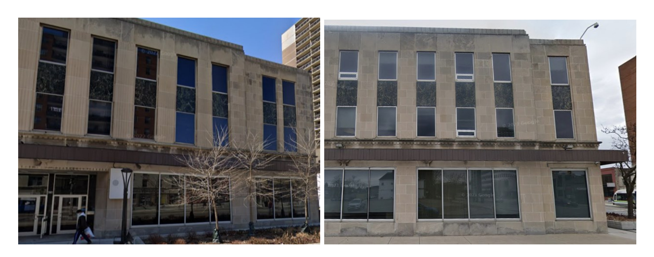
Google StreetView of the building in March 2021 and December 2020