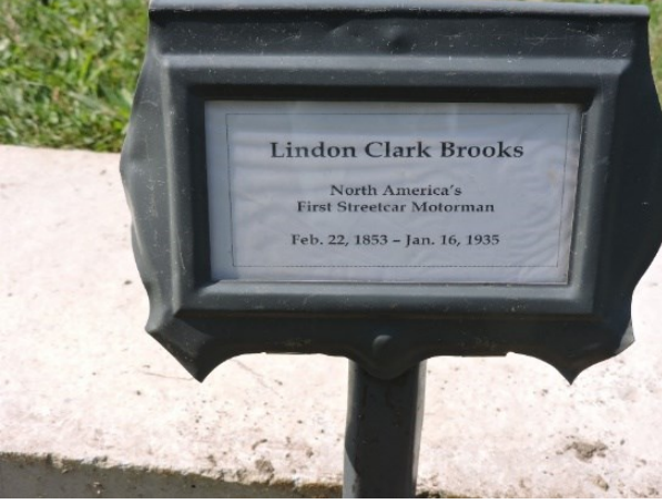
Photograph of the temporary grave marker that the volunteers and cemetery installed on the unmarked grave of locally significant resident Lindon Clark Brooks