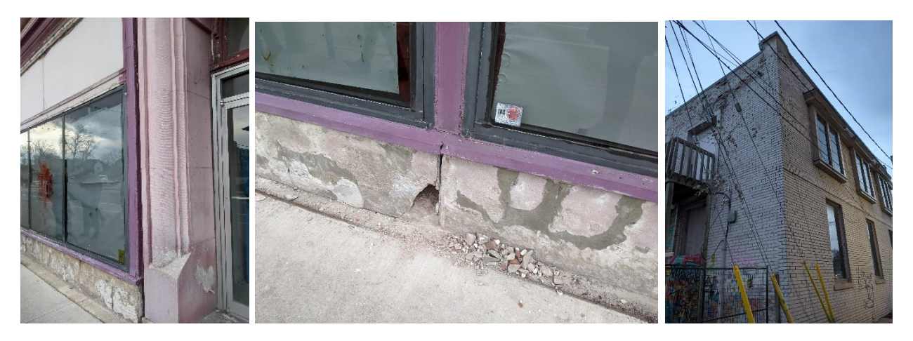
Photographs of the building in its previous state, showing some deterioration of storefronts