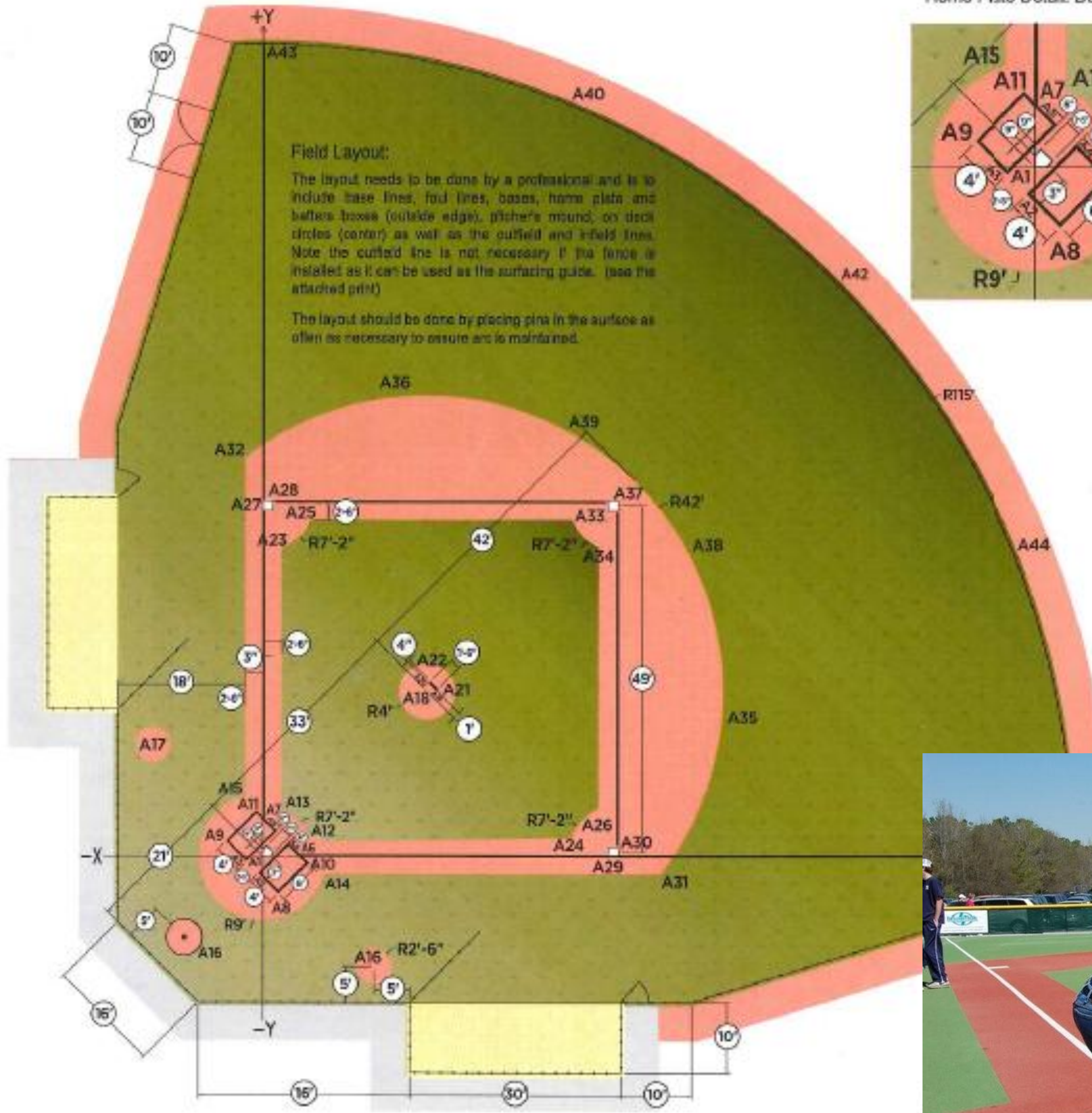
Home Plate Detail: Double Scale