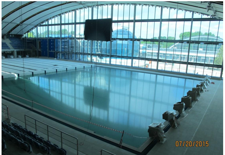
Visit to Aqua Lublin.