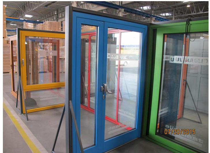
Visit to Aliplast.

The delegation also visited Aliplast, a most modern factory for the manufacture of aluminium mouldings at specified sizes and colours and most importantly supplying them in record time to the customer. It is undeniably “state of the art”. Not surprisingly, to meet rising demand the factory is growing, already employing more than 300 people.