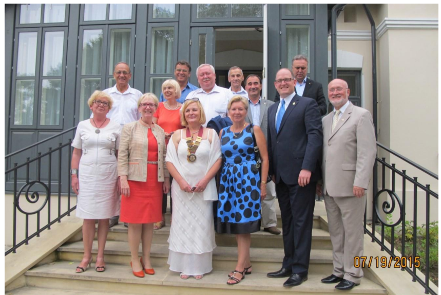
Meeting with the Rotary Club, the "Old City".

In Poland, the year 2015 is the year of local councils. These are very important, because they determine the standard of living guaranteed to inhabitants of the cities and villages. The twinning of cities is an interesting initiative for the building of bridges between local councils through cooperation. Lublin in Poland and Windsor in Canada have been two such cities for the past 16 years. Lublin presently has 24 twin cities (including several in Ukraine), whereas the smaller Windsor has only 12. Recently, a very important initiative of an international nature on the part of Lublin has been to unite its twin cities for the purpose of carrying out clearly defined joint projects.