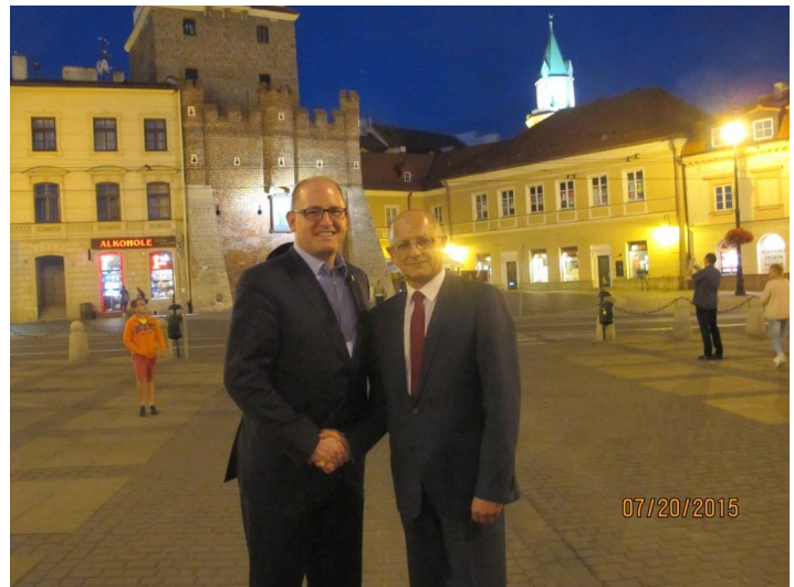
Close of the Visit to Lublin.

During the discussions, the Mayor of Lublin received a formal invitation to visit Windsor in October for the celebration of the 20 th anniversary of the Association and the 15 th anniversary of the twinning agreement. The invitation was accepted.