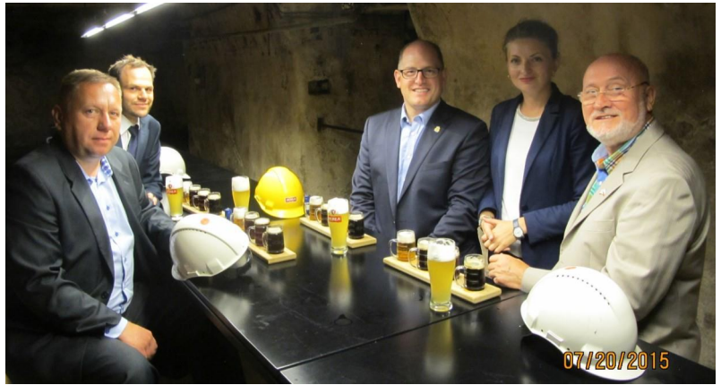
Visit to “Perła” Brewery.

This all could not have taken place without a visit to “Perła” (“Pearl”), the brewery of the famous Lublin beer, which is expanding continually to keep up with the increasing demand for the popular beverage. It was a pleasant surprise to learn that the owner of the firm is a Canadian. This is a good example of the creation of a good business with an international perspective. If only this beer would reach Canada, perhaps even Windsor, just as from not so long ago the famous Windsor whiskey Canadian Club can be purchased in Lublin.