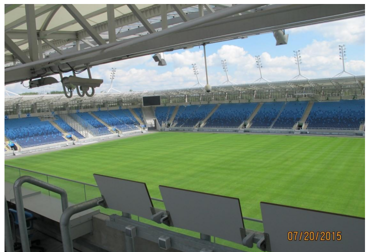
Visit to the Lublin Arena.