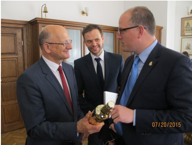
Meeting with the Mayor of Lublin.

For a decade and a half, there have been numerous visits in both directions - official, business and educational – but particularly memorable is the visit by a delegation from Lublin, on the occasion of one hundred years of the Polish community in Windsor. It was then that the citizens of Windsor received from Lublin the Goat Fountain, a beautiful sculpture in bronze, which to this day is a distinguished ambassador of Lublin. It is located at a picturesque site along the Detroit River, a favourite place for the citizens of Windsor to take walks. The Goat Fountain, the original of which is in Lublin, not far from City Hall, is one of a number of attractions; in places, it is polished, where it was touched by the hands of thirsty passers-by.