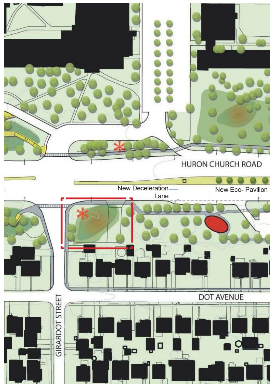
Plan Blow-up- Dashed square identifying recommended site for acquisition