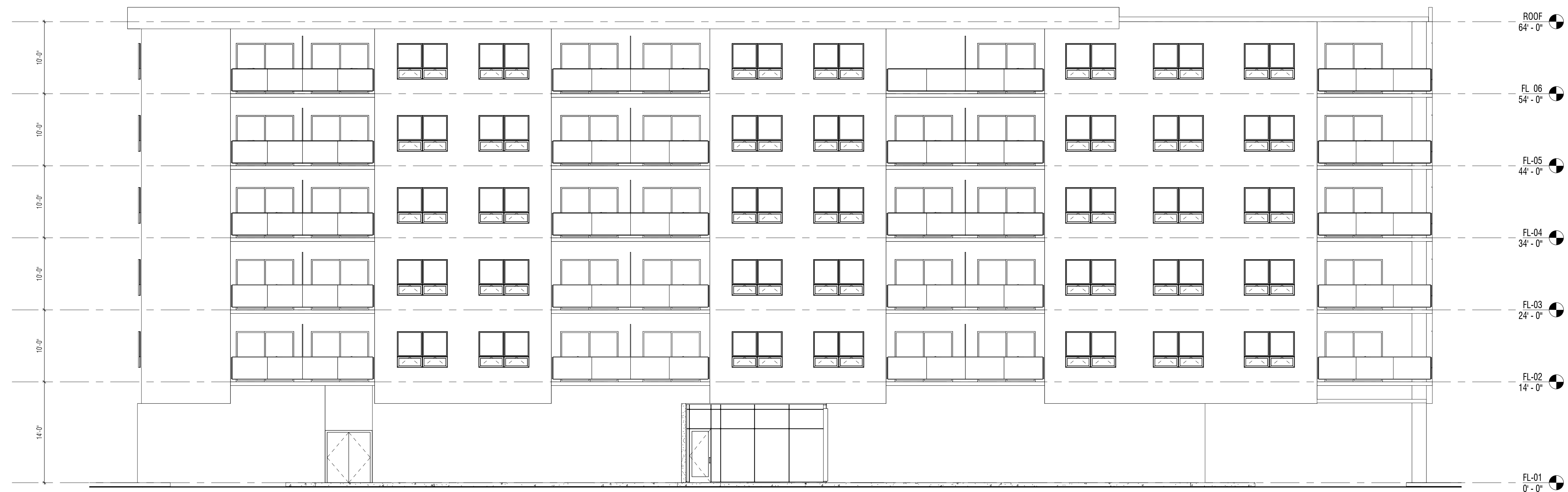
EAST-ELEVATION SCALE: 1/8" = 1'-0"