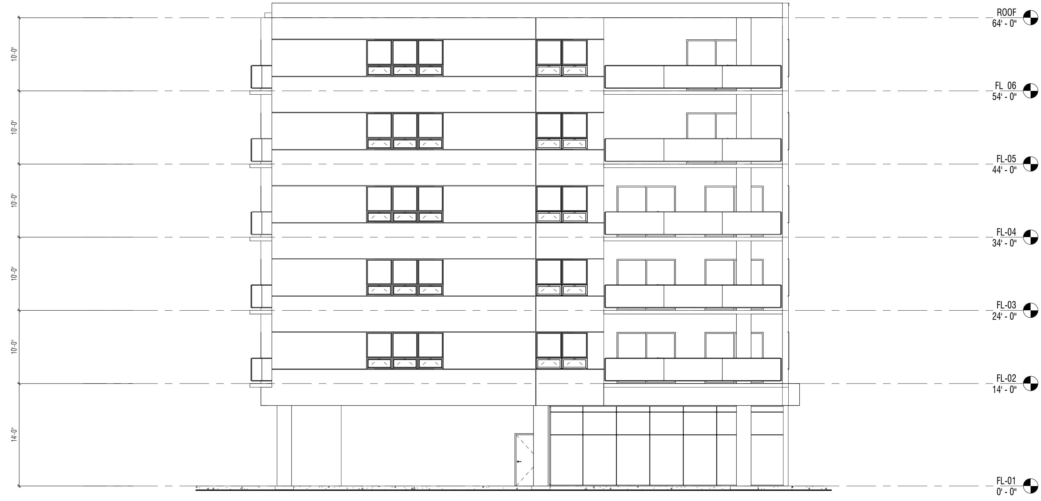
NORTH-ELEVATION SCALE: 1/8" = 1'-0"