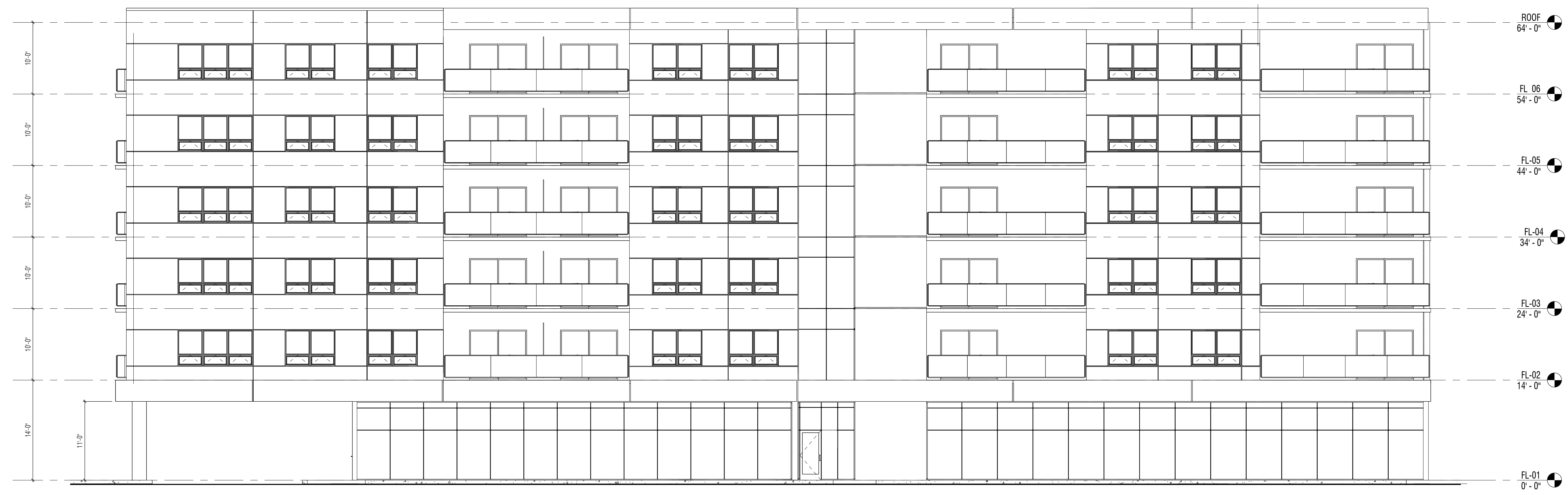
WEST-ELEVATION SCALE: 1/8" = 1'-0"