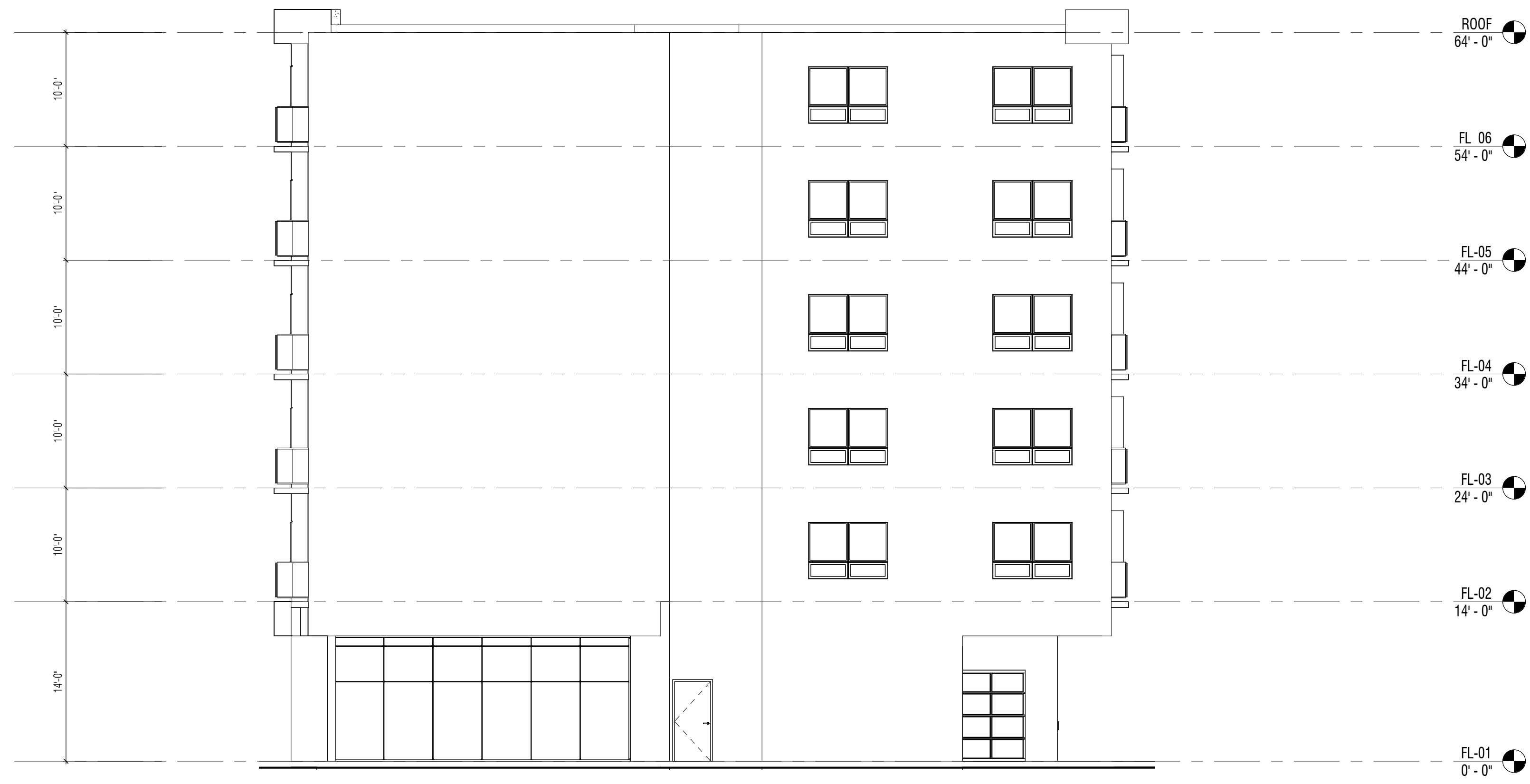
SOUTH-ELEVATION SCALE: 1/8" = 1'-0"